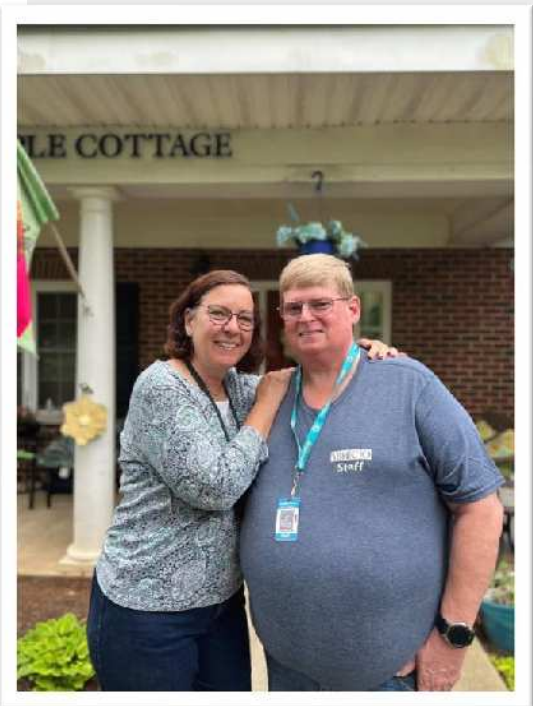
We need houseparent couples!

Order your Christmas Cards from the School of Graphic Arts while you still can!