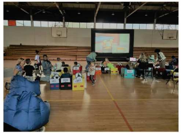
Drive-in Movie Fun

The Board approved two new positions to begin operations of a Community Support Center beginning next year. The CSC will offer collaborative services with several other organizations to provide services to families and children on campus and beyond the gates. This is a significant development as MHCO extends the incredible services beyond the gates. Over the next year an Outreach Program will be developed to help families in your neighborhoods network with services for their children and be able to stay in their own homes. We will share more as the program develops. We say thank you to the Board for their trust in expanding programming and working to help more children receive the care they need.