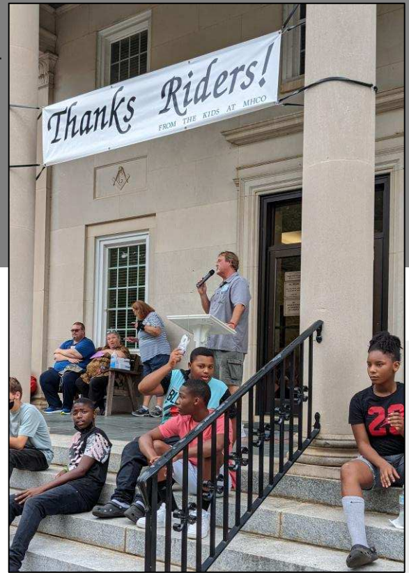
Eureka Charity Ride

The Friday before school began was a very nice day on campus. Everywhere I went I saw children, youth, and staff active and moving about. They were completing tasks to get ready for school, helping others out by moving furniture, taking walks on a beautiful day, participating in the water games, riding bikes, and just being kids. The fellas showed off their new book bags that had detachable carry bags. The best part of the day was all the children were happy and smiling.