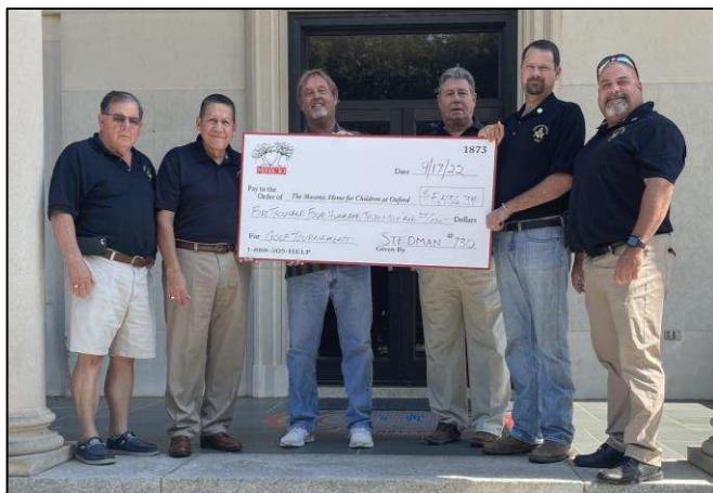
Shout out to Stedman Lodge for their recent donation!