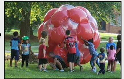
Fun in the Sun