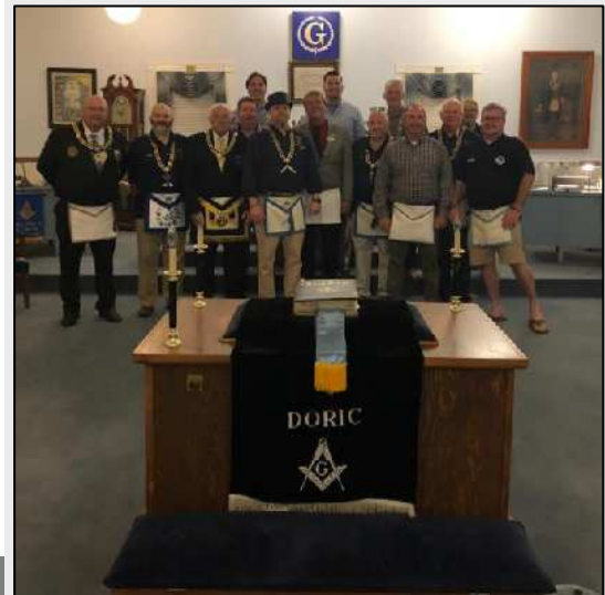
MHCOC visits Doric Lodge in PA