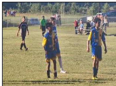
MHCOC Athletes - Northern Granville Middle School Boys Soccer