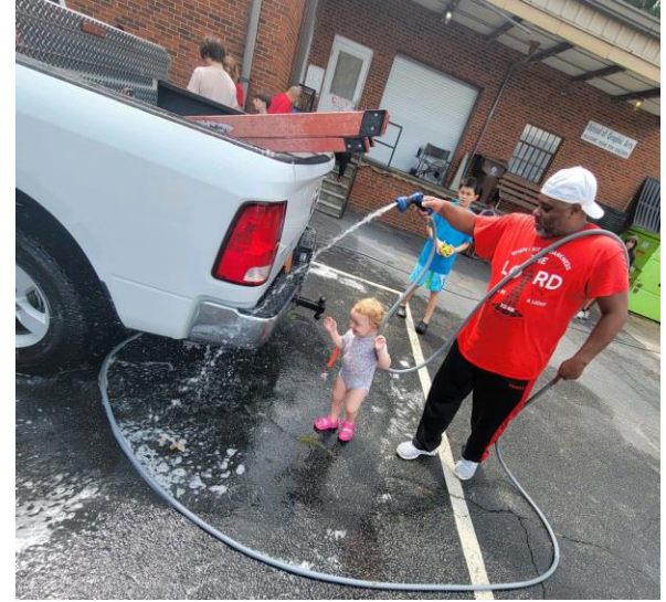
PSA Day – Everyone is grateful for our public servants!