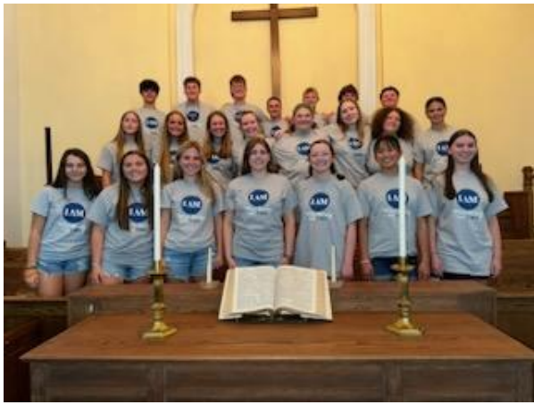
Allstar Youth Choir of NC sang to the kids!