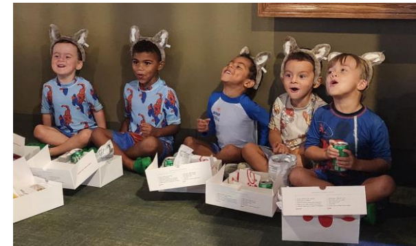
Great Wolf Lodge