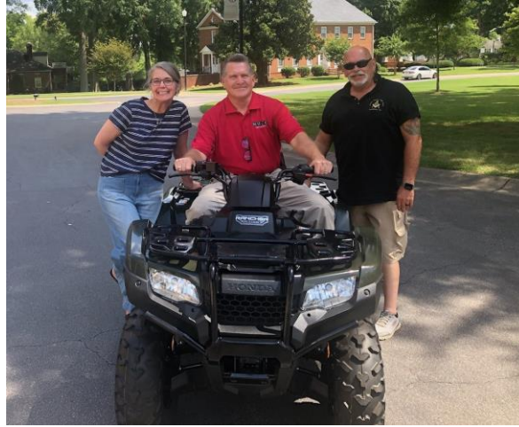
Swansboro Lodge gifted the Home a 4-wheeler for our Security Officer! Thanks!