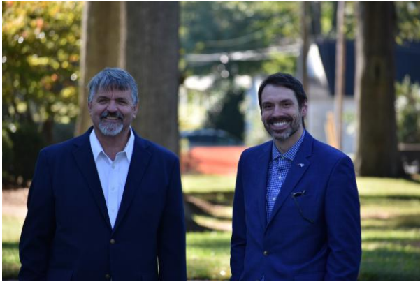
A good time was had by all and there were lots of familiar faces!